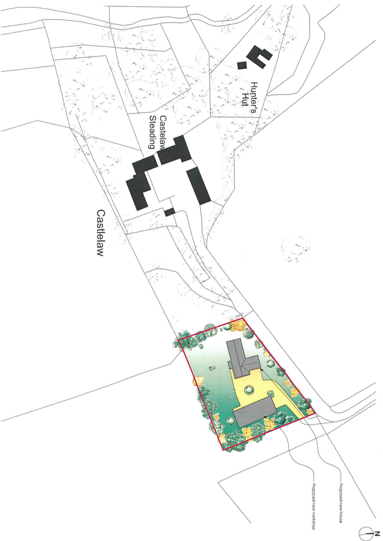
4 Proposed Site layout Scale: 1:500